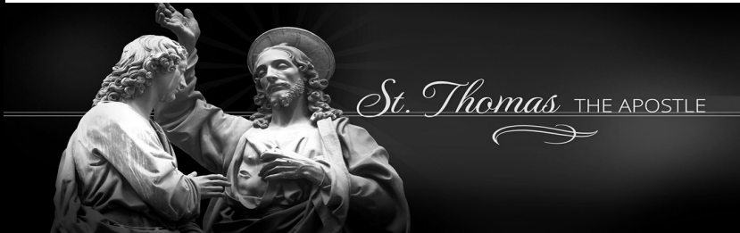
St. Thomas THE APOSTLE

On July 3rd, the Church celebrates the feast day of St. Thomas the Apostle. Best known for his initial unwillingness to believe the other apostles in their claim that Jesus had risen from the dead, St. Thomas can teach the faithful about believing without seeing. As an apostle, Thomas was dedicated to following the Lord. Upon hearing that Jesus was returning to Judea, an area that would pose dangers due to the growing animosity of the authorities there, he immediately said to the other apostles, "Let us also go, that we may die with him" (Jn 11: 16).