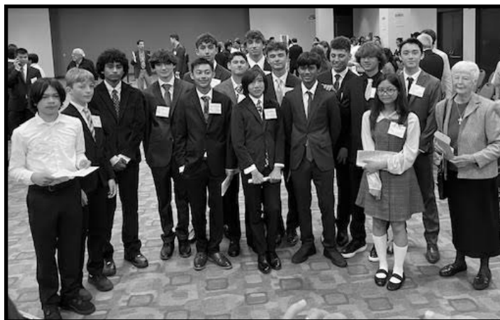
ST. MONICA 8TH GRADE PARISH CONFIRMATION STUDENTS. CONGRATULATIONS!

“Love our Lady. And she will obtain abundant grace to help you conquer in your daily struggle.” ~ Saint Josemaria Escriva