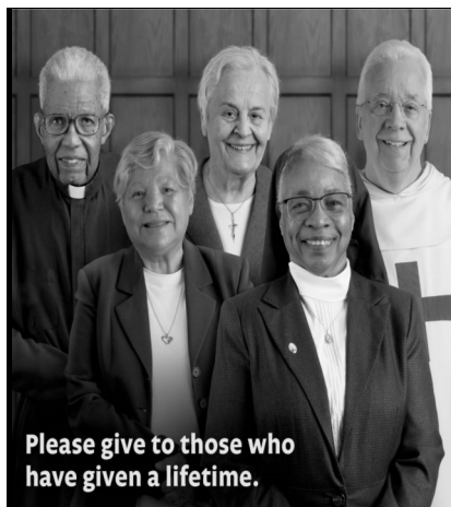
Please give to those who have given a lifetime.